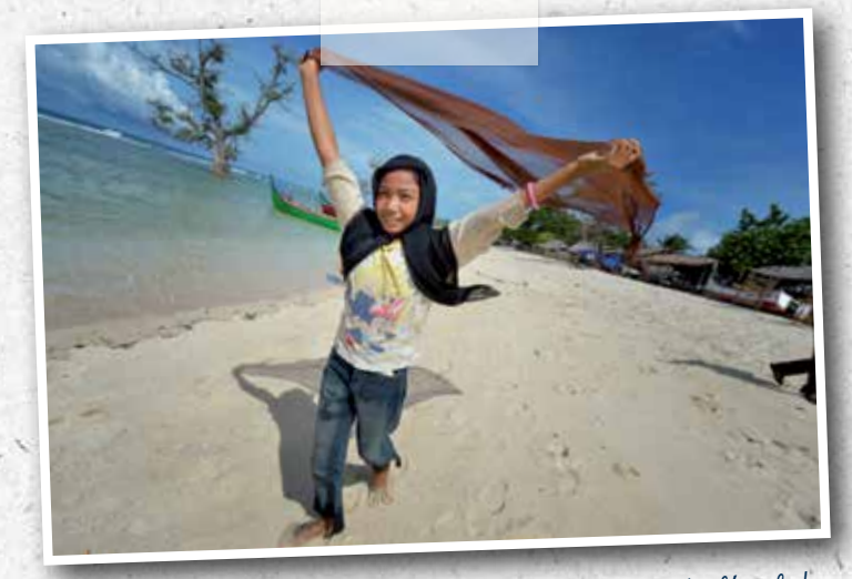
www.kerkinactie.nl (Dutch) · www.protestantsekerk.nllenglish

It is our calling to share what we have received. Believing that everyone is created in God's image, we value all people. The church is in action everywhere: from the heart of the city of Rotterdam to remote villages in Uganda. Wherever people persevere in their faith in the face of oppression, welcome refugees with open arms, stand up for children in need, care about minorities, and embrace those who are excluded.